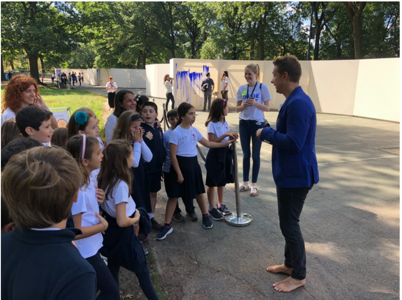
Jeppe Hein instructs New York City school children on how to participate in his public art piece, Breathe With Me .